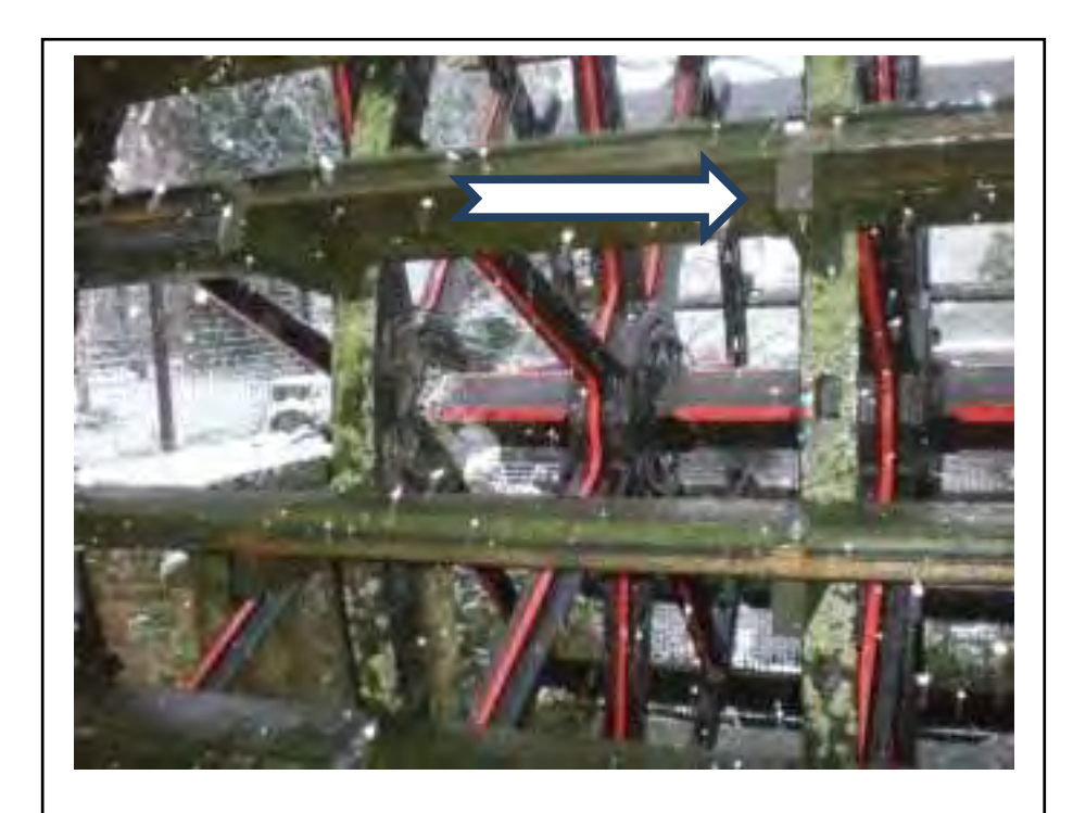
Figure 7 The mill wheel at Merton Abbey

We hear from our friends in the Make Colliers Wood Happy team that there will be a Christmas version of Kidsfest at Merton Abbey Mills on 22<sup>nd</sup> December. The Colliers Wood chorus will be singing on the bandstand,