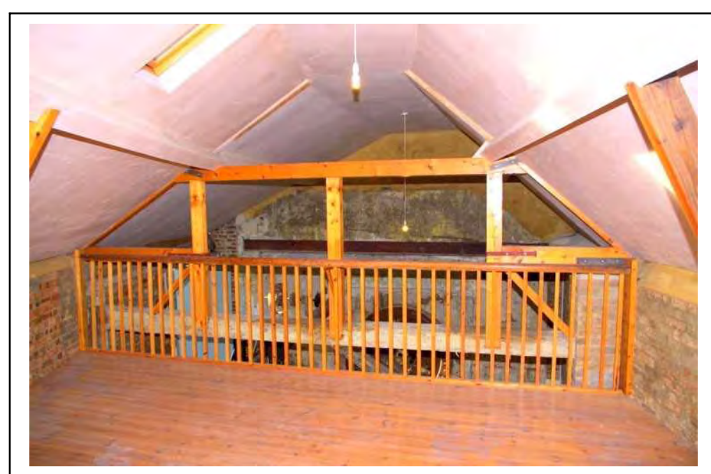
Figure 11: The mezzanine floor inside Ravensbury, looking through the balcony to the wall through which the mill wheel drive shaft still comes. We can't wait to be there.