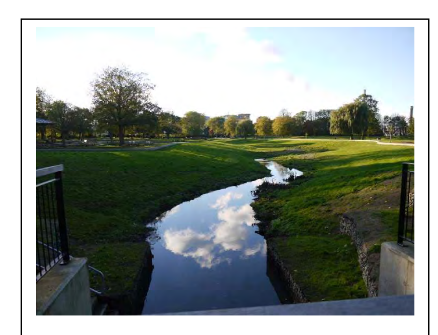
Figure 4 The Wandle, above ground in Wandle Park

We are hoping that we can identify and add further information to some of our