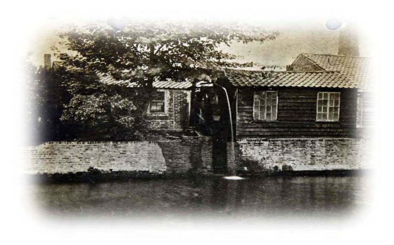
Figure 10: Paxton's Leatherworks

Whilst working on the Merton Memories Project for the Local Studies Centre in Morden Library I come upon this photograph. The title of the photograph