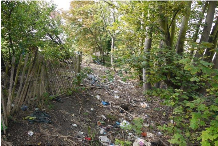
4 - course of old river bed at Ravensbury Terrace

at this point is a pair of unusual manhole covers with open gratings. Running water can clearly be heard flowing in the conduit beneath, so I assume this is the stream. I visited the adjacent parallel roads, namely Braemar Avenue, Normanton Avenue, Alverstone Avenue and Wolseley Avenue and found no similar manhole covers, but each street dipped towards its middle possibly indicating a tiny valley running at right-angles to the roads. In the next street, Durnsford Avenue, there was another manhole cover of the same unusual design as that in Melrose Ave, and on about the right line, but there was no sound of water flowing below.