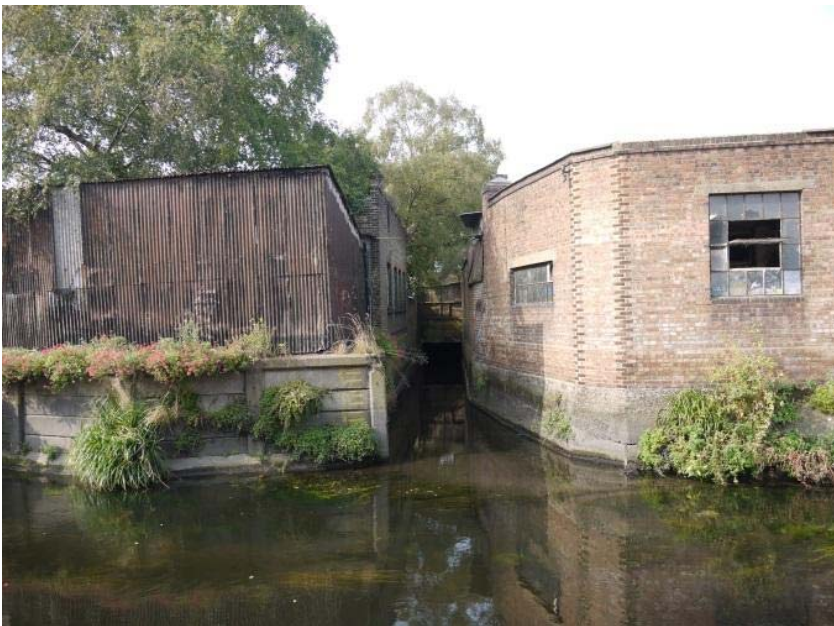
5 - stream joins the Wandle

gate of the adjacent yard. This is exactly on the line of the old river bed mentioned above, which lies on the other side of the road. I have assumed that this is the former course of the stream, which has now been diverted into a pipe under the streets, then released into its former course for the last few yards. The boundary between the parishes of Wimbledon and Wandsworth, and the boundary between the boroughs of Merton and Wandsworth follow the stream at this point between Ravensbury Road and Haslemere Avenue.