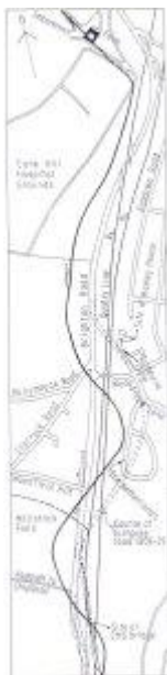
Fig.22 Route Plan (5) Coulston to Chipstead [78.8kb]

From Hollymeoak Road the railway continued on across Brighton Road, then the two sets of railway tracks (the original London and Brighton route and first, the later "Quarry Line"), and