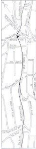
Fig.20 Route Plan (3) Purley to Coulsdon [78.8kb]