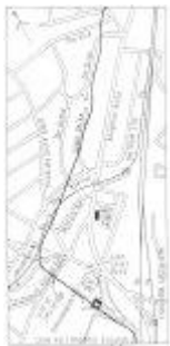
Fig.21 Route Plan (4) Coulsdon [78.8kb]

the east side of Downlands Road, and crossed that road at its junction with Smitham Downs Road. Part of this stretch was identified by terracing on the 1867 Ordnance Survey maps. At the rear of the Council Offices on the east side of Brighton Road was the site of a small gravel pit, and a branch from the railway ran down to it from a junction just south of Grovelands Road. Bayliss noticed the pit, but misplaced the branch showing it further south.