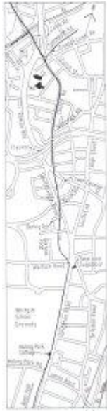
Fig.18 Route Plan (1) [78.8kb]