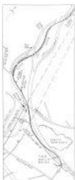
Fig.24 Route Plan (7) Merstham [78.8kb]

At this point the route of the railway and the road had begun to curve towards the east, and about 170 yards past the bridge site is Weighbridge Cottage (No.201), now a private house but formerly the toll house