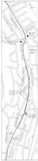
Fig.19 Route Plan (2) South Croydon to Purley [78.8kb]

northern arm of Biddulph Road, about 40 yards from Brighton Road. This stretch was for the most part slightly to the east of the present footpath at the rear of the houses in Brighton Road. A footpath on the railway route here is shown on the 1867 Ordnance Survey maps with terracing below it, and in 1900 Paley wrote that here "the course of the line begins to be clearly marked by a line of rough posts and wire fencing. This continues a considerable distance during which it may be plainly seen from the Brighton Railway, passing a large quarry on the way." [4] It was about here that Charles Anderson noticed in 1923 that "the 'shelf' on the hillside indicating the course of the tramway can be plainly seen." [5]